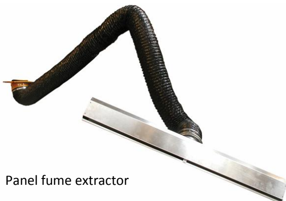
Panel fume extractor

Recommended airflow volume: 1000-2000 m 3 /h