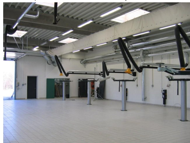
Workshop Environment with Panel fume extractor