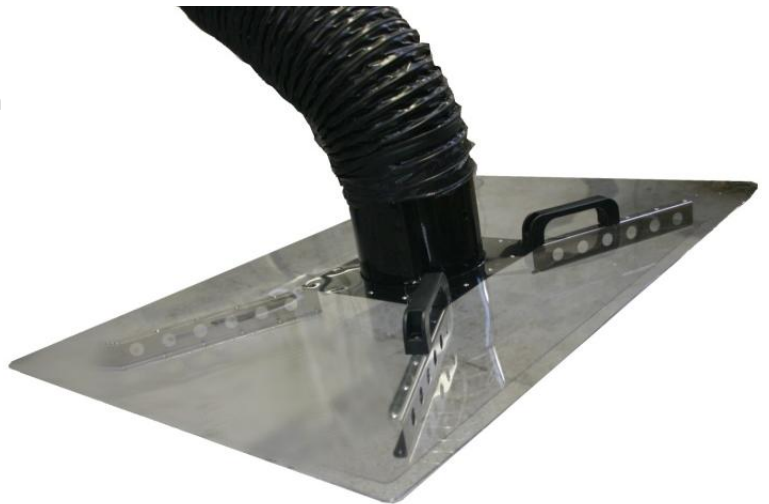
Extraction hood for windscreen gluing