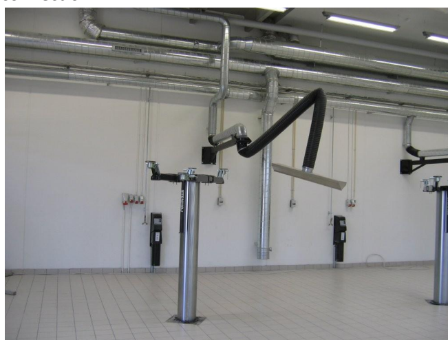
Workshop Environment with Panel fume extractor