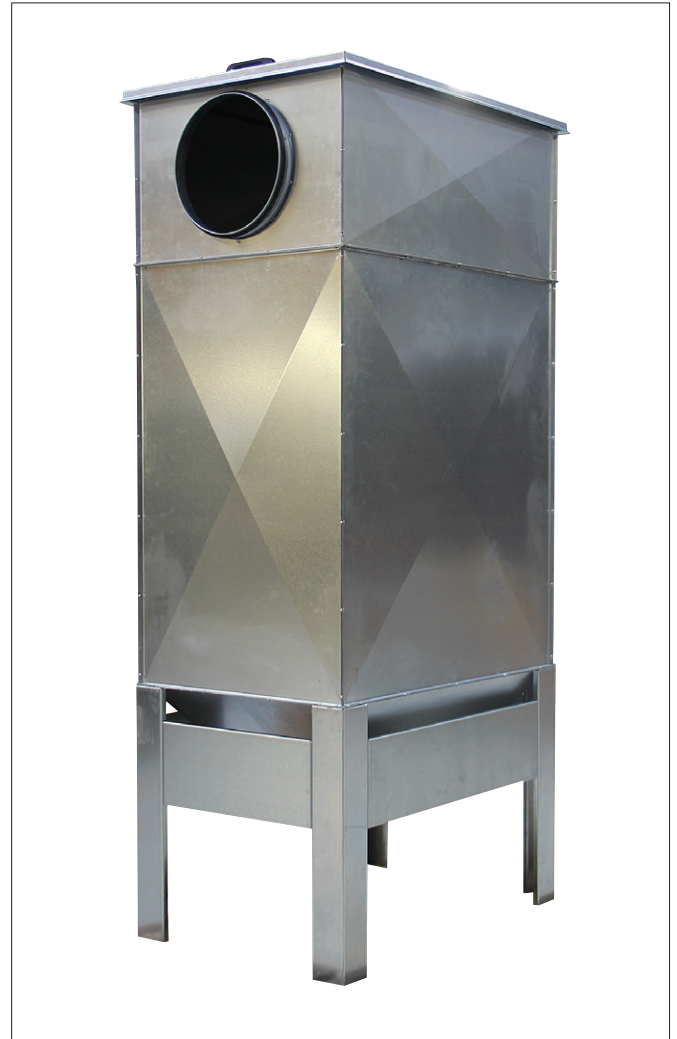
GFO – XT filter for Oil mist

Geovent Oil mist filters GFO and GFO XT need regeneration time, so the oil can drain. For continuous operation it is recommended to have 2 oil mist filters that change every 3 hours, depending on the load.