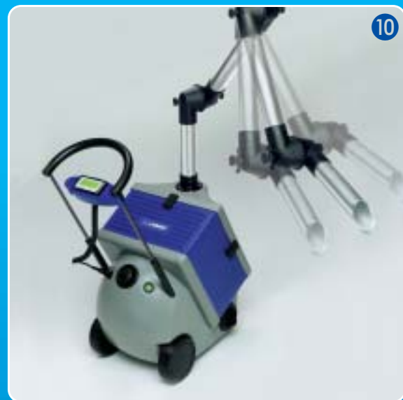
Figure 10 you see the unit with the telescopic handle extracted and the extraction arm mounted – ready for a 100-percent mobile operation.