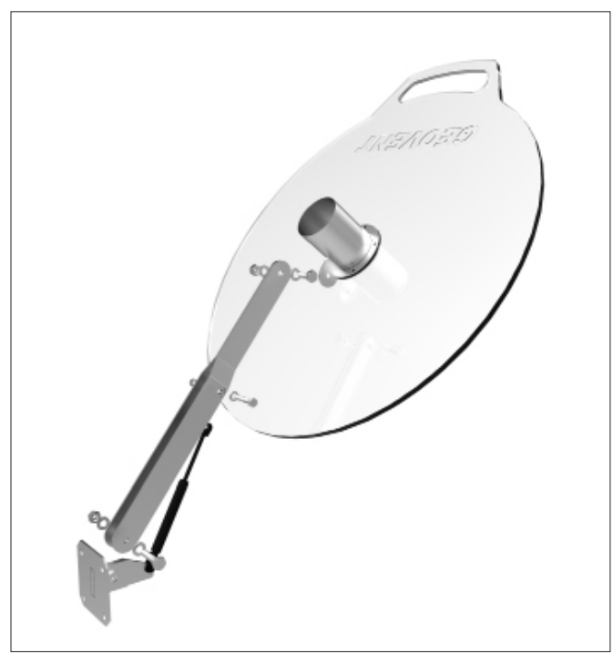
The lid is available in polycarbonate