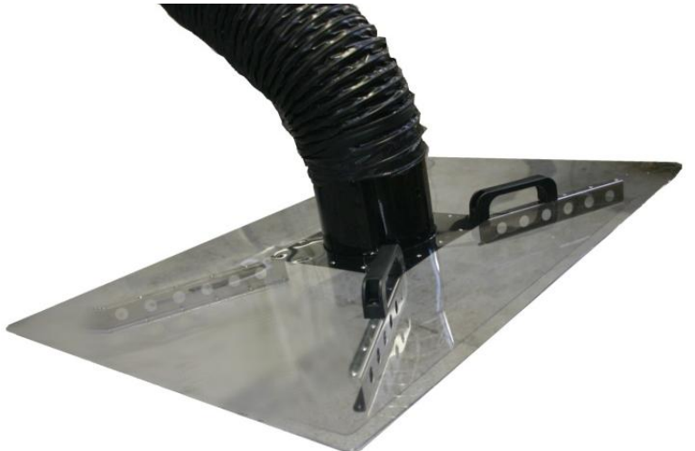
Extraction hood for windscreen gluing