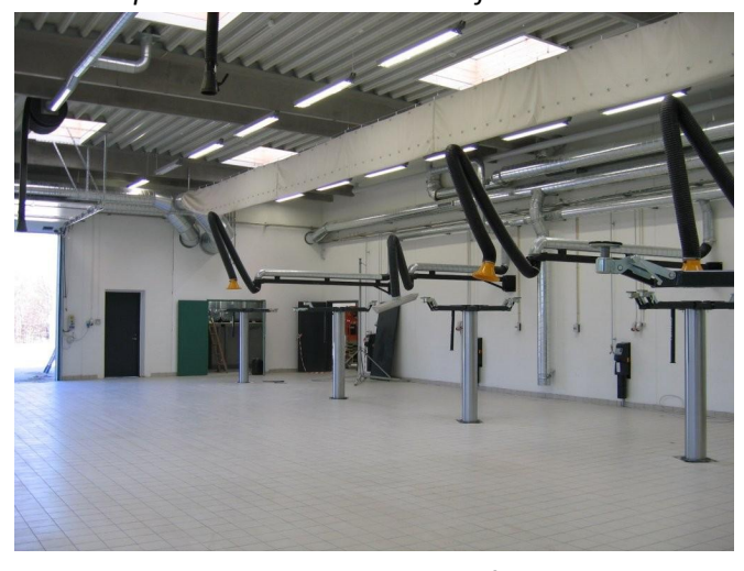
Workshop Environment with Panel fume extractor