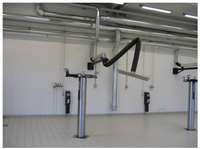
Workshop Environment with Panel fume extractor